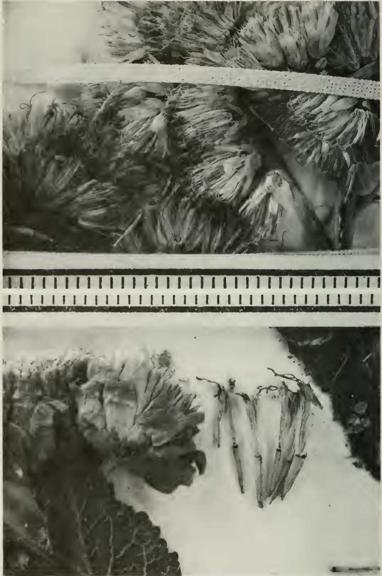
Enlargements of heads. Top: Austroeupatorium morii . Bottom: Flyriella harrimani .